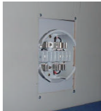
Surface Mount Adapter installed