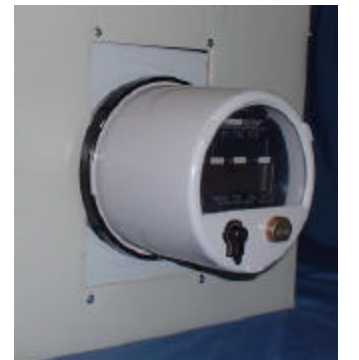
Surface Mount with meter installed

For more information on any of our products please visit our Web site at www.SouthernUtility.com or contact your local distributor or sales representative. Southern Utility Services, Inc. 770-448-6810. Sales@SouthernUtility.com