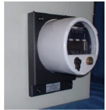
Retrofit with meter installed