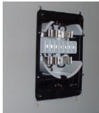
Retrofit Adapter installed