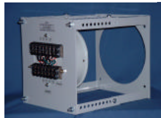
Fully Expanded Flush Mount Adapter