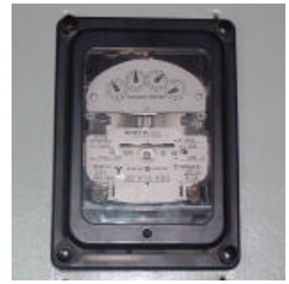
Typical switchboard (panel) meter