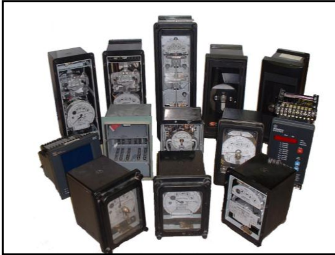
What you have