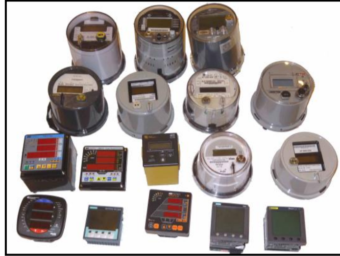
What you want