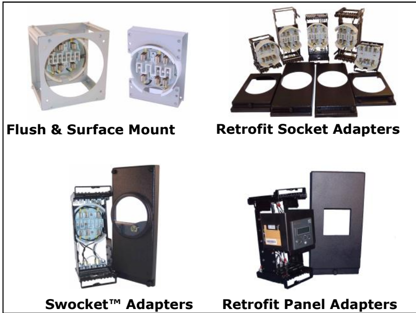
Flush & Surface Mount