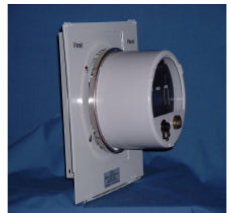
Adapter with Meter in Demo Panel