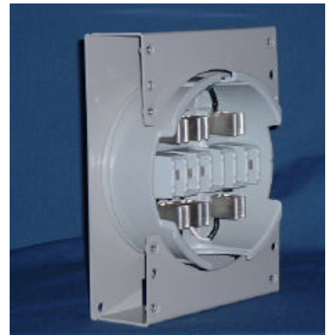
Surface Mount Front View