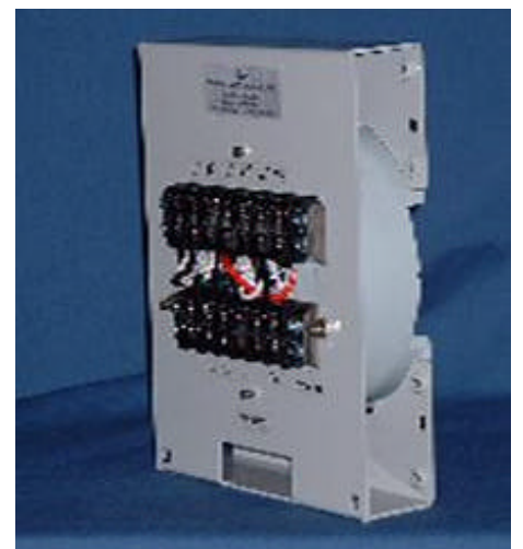
Surface Mount Rear View